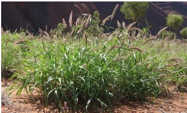
Buffelgrass ( Pennisetum ciliare )

Contribute to science and help us steward the White Tank Mountains